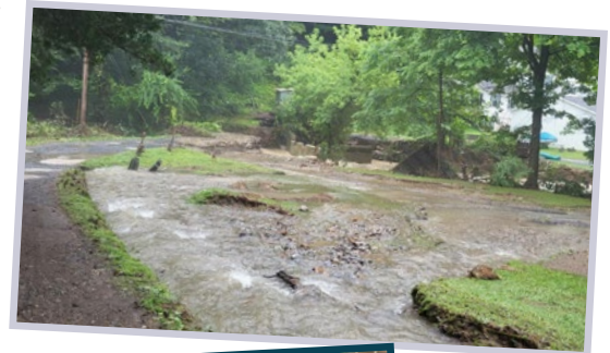
Above: Several, private bridges washed away during summer storms last year.