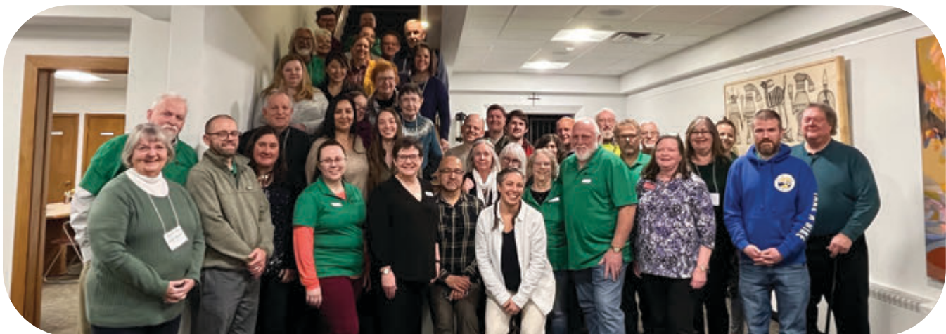
The LDR Community of Practice | November 2023