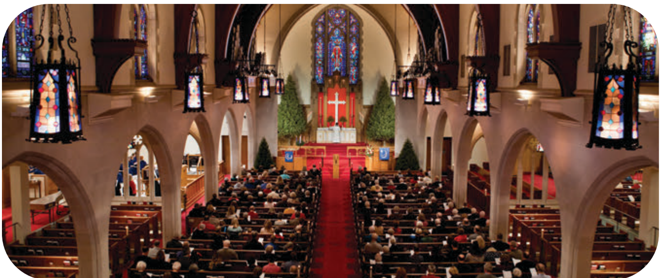
Mount Olivet Lutheran Church in Fargo, N.D.

LDR Connections to Synods and Congregations is designed to help synods and congregations understand the different ways to be involved in disaster response. The course identifies the different phases of a disaster and examines disaster's broader definition, from weather-related events to care for the creation, school shootings, and water crises. The course also covers the importance of volunteers. It prepares participants with an overview of forms, processes, orientation, and ways to best utilize volunteers in the ways your synod or congregation may want to become involved with Lutheran Disaster Response.