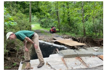
Above: One of four private bridge collapses following heavy flooding.

The Lutheran Disaster Response (LDR) program of the Evangelical Lutheran Church in America (ELCA) is working with leaders in Pacifica Synod and other partners to assess the needs of people impacted by the wildfires. LDR will work with them to provide for immediate needs and recovery amid the widespread destruction. LDR is committed to accompanying recovering communities in the years ahead.